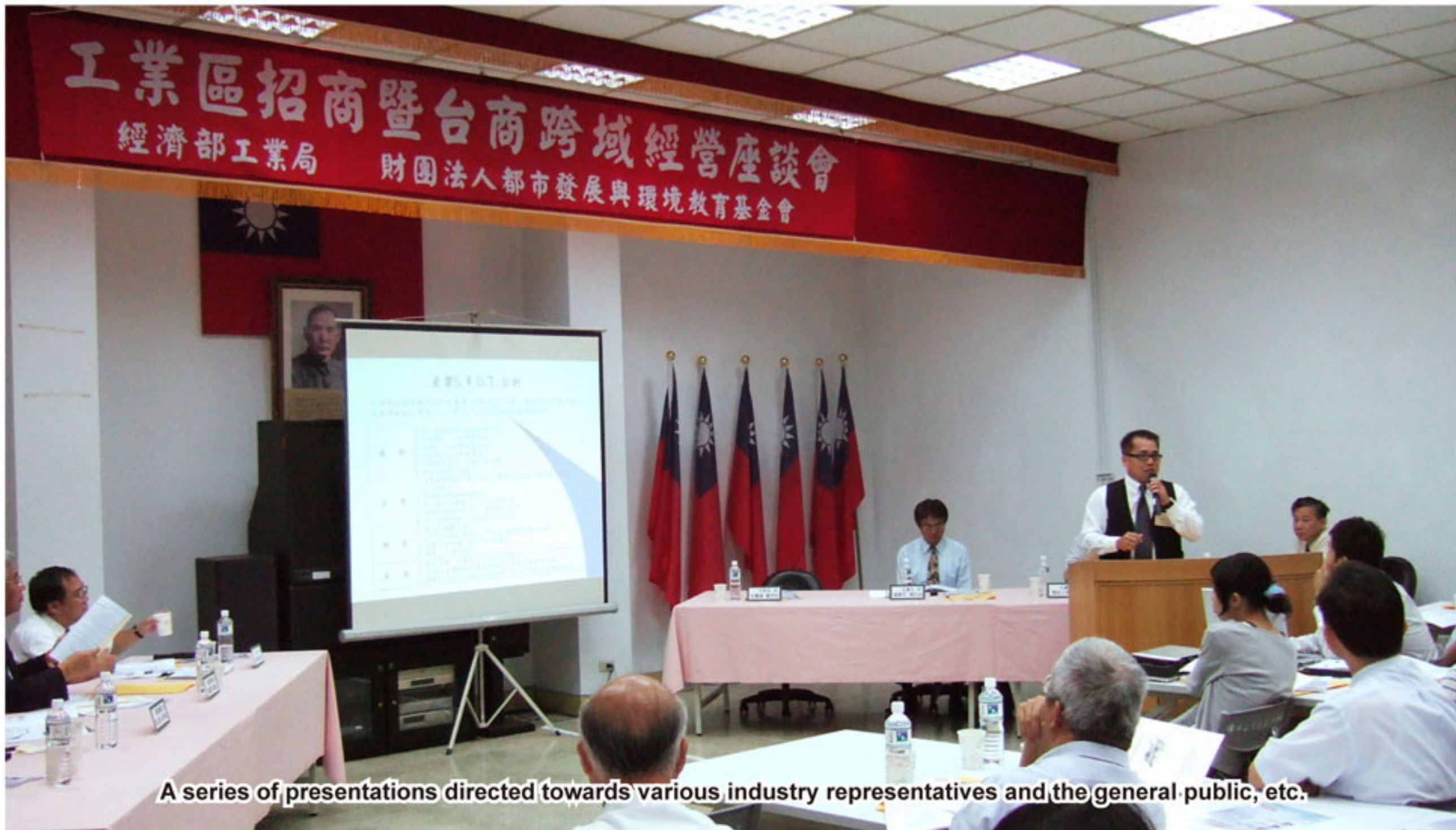
A series of presentations directed towards various industry representatives and the general public, etc.