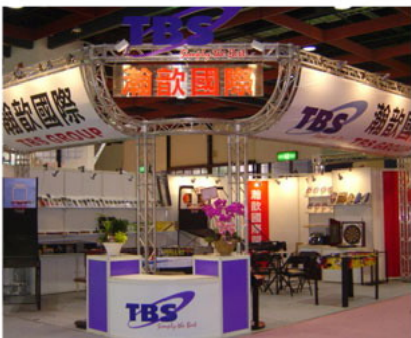
Another view of our exhibition – These exhibitions give us the chance to find and more business opportunity.