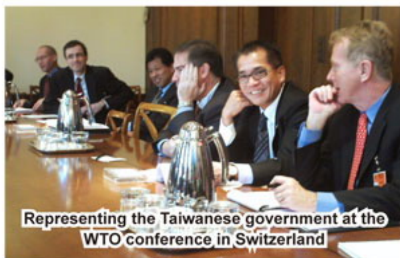
Representing the Taiwanese government at the WTO conference in Switzerland