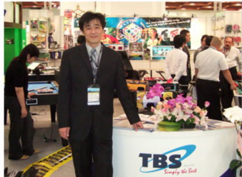
Every year, there are 3 or 4 international exhibitions, and TBS never misses a chance to make an appearance.