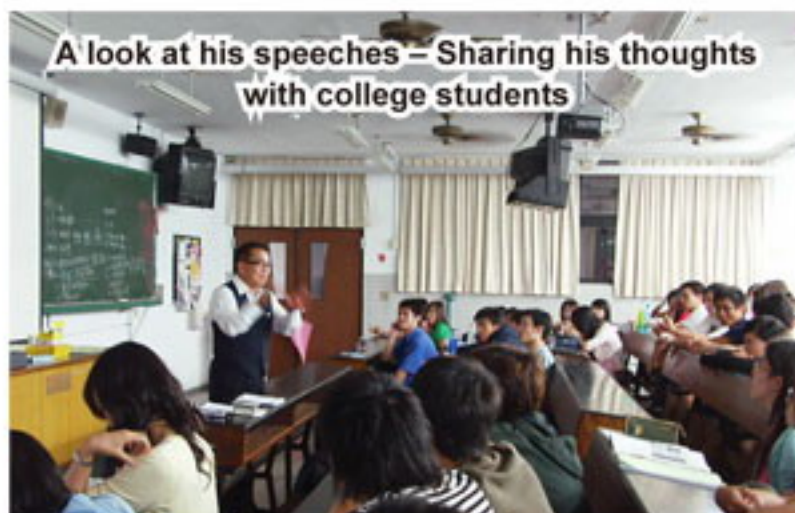
A look at his speeches – Sharing his thoughts with college students