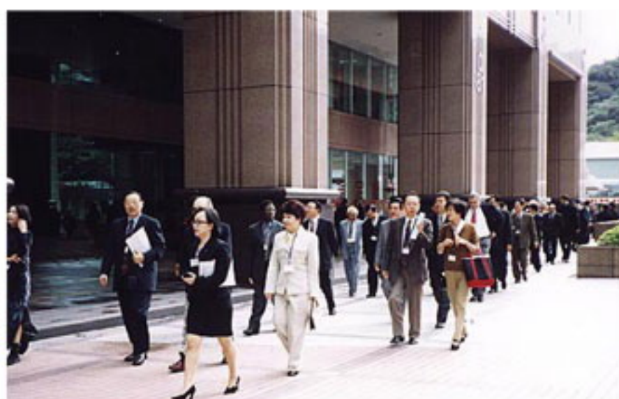
Taiwanese Government arranged for a group of ambassadors to visit TBS Group Corporation.