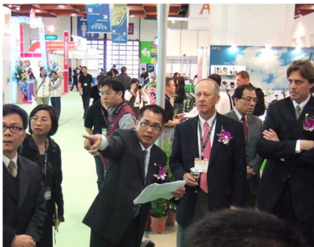
He is always focused on his own business, but he will never forget to promote and introduce Taiwan's sporting goods industry.