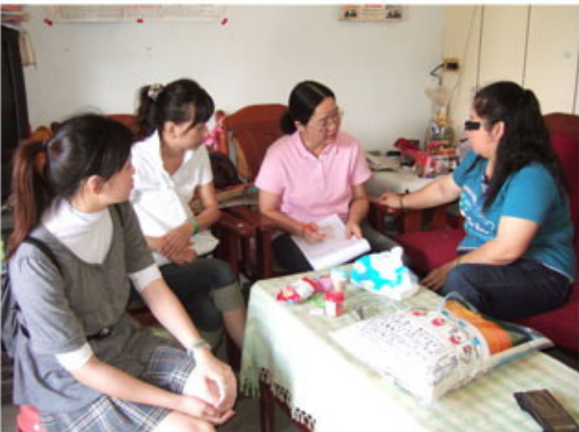
Recording the individual needs during visits is foundation of our care, and we can better offer help where it is needed most.