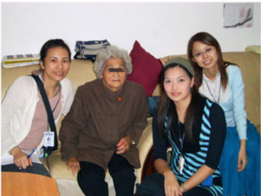
Grand Mothers are always in need of our assistance and concern.