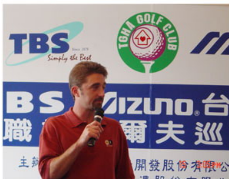
TBS specializes in sporting goods, but we never forget to promote and improve Taiwan's professional golf. TBS and Mizuno cooperated in holding the Taiwan's Pro Golf Tournament.