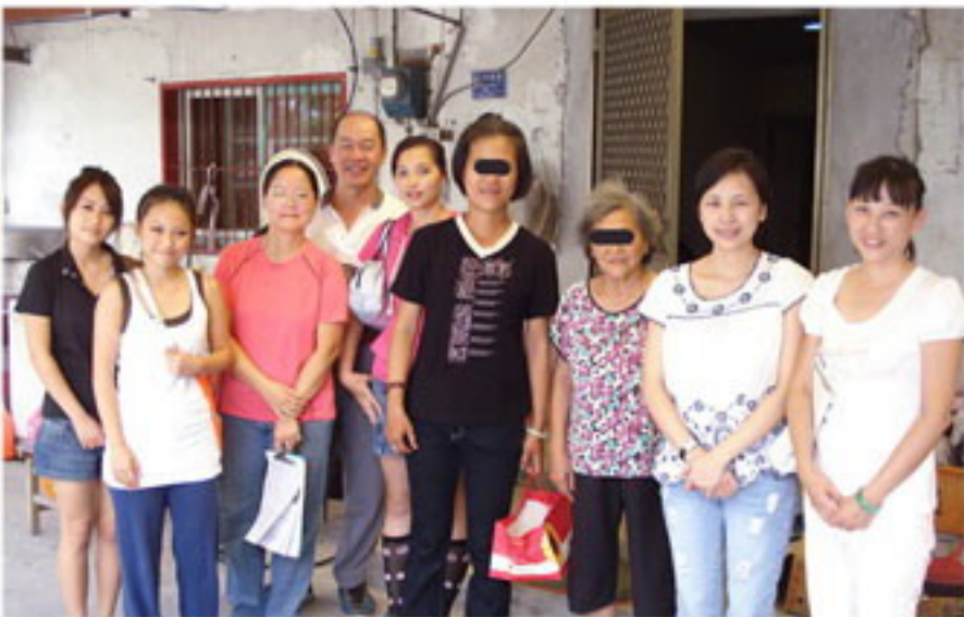
Frequent visits allow us to see if our aid has really helped them move forward to a better life.