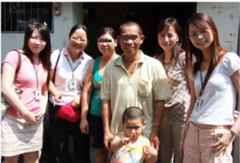
Children are the future pillars of hope, and in the forgotten corners of society you can find a young ray of promise that needs our help.