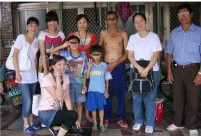
The elderly and adolescent need even more of our care and generosity.