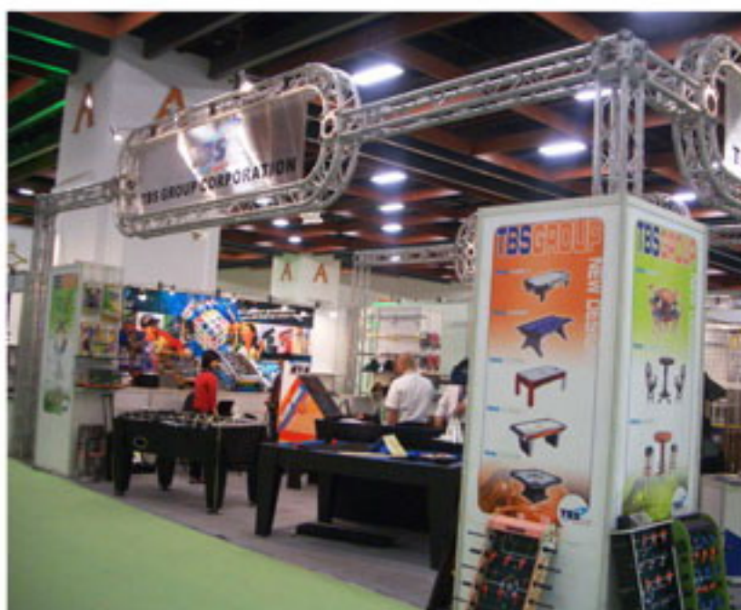
A look at our exhibition - There has never been a shortage of business opportunities, but success depends on our own commitment and dedication to our work.