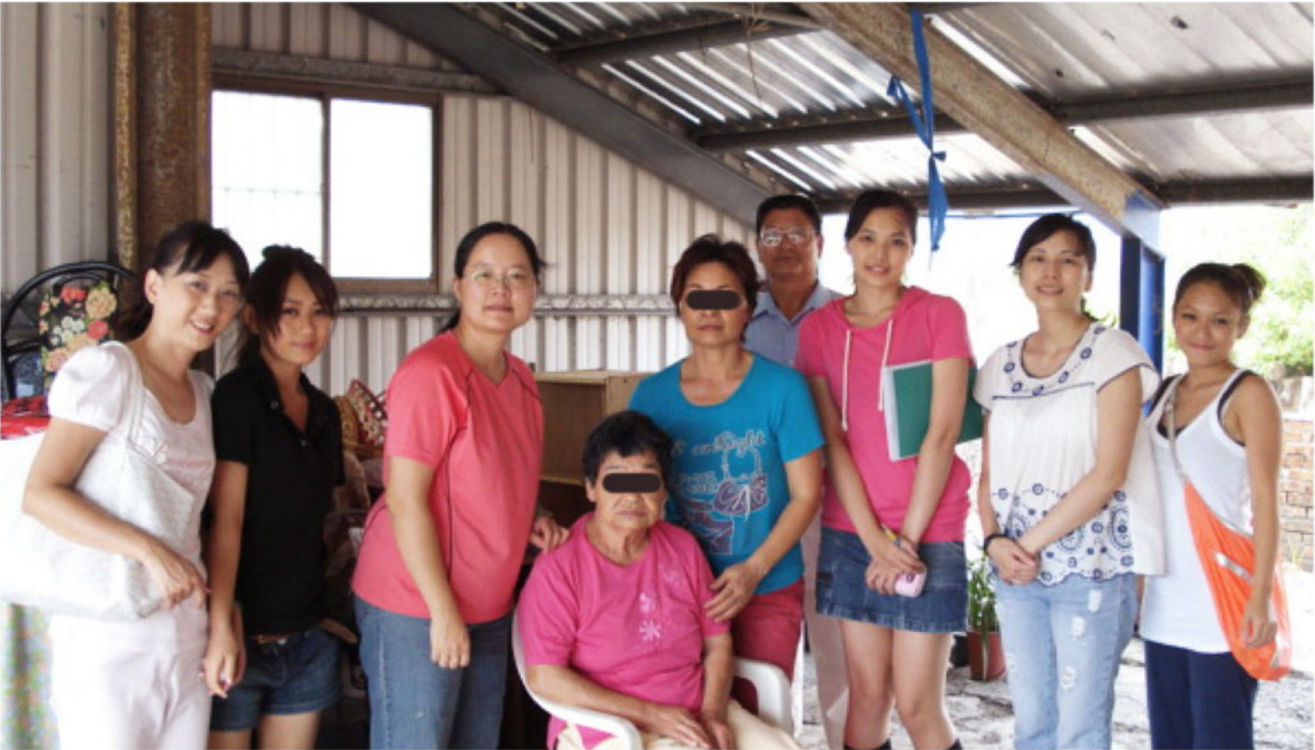
Our regular visits every 2 months let us show our sincerity in this commitment and take care of any emergencies.